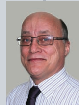
Robert Johnson Libraries and Community Recreation 01902 55 2186